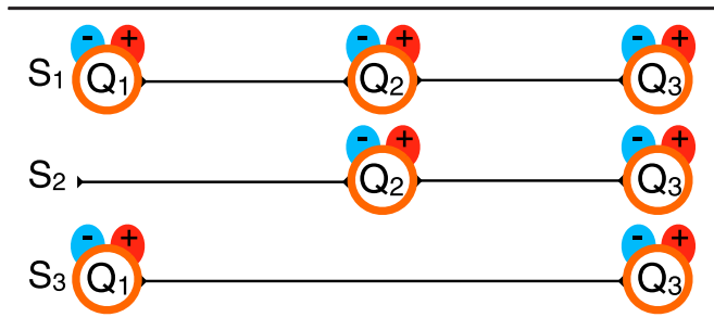
FIG. 1 (color online). Schematic representation of the Leggett-Garg test. An observable Q is measured at different times t_i (represented along the horizontal axis), giving results Q_i . Macrorealism assumes noninvasive measurements, with the consequence that correlations, e.g., C_{13} = \langle Q_1 Q_3 \rangle , are equal, independently of which sequence was performed to obtain them. S_1 and S_3 , which differ by the presence or absence of Q_2 , give the same C_{13} in macrorealism but not in quantum mechanics. LGIs can detect macrorealism violations using experimentally observed correlations.

the macrorealist to a position strongly resembling quantum mechanics.